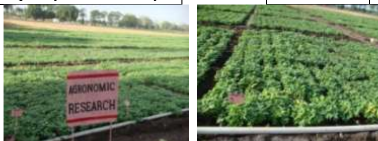
(Main Oilseeds Research Station, JAU, Junagadh)