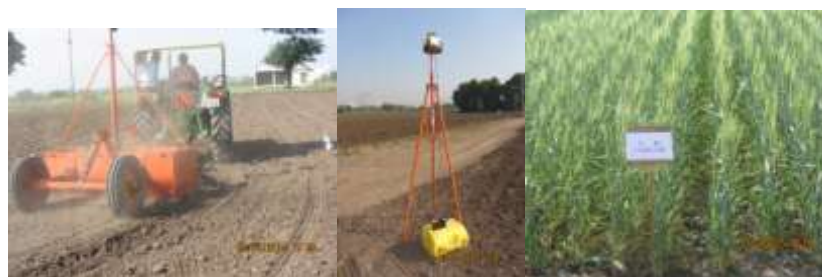
(Department of Agronomy, CoA, JAU, Junagadh)

The farmers of South Saurashtra Agro-climatic Zone growing wheat in rabi season are recommended to apply 10 irrigations, first immediately after sowing and remaining 9 irrigations at 8-10 days interval (at 0.9 IW/CPE ratio) for securing higher yield and 10 per cent water saving.