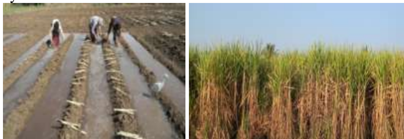
(Main Sugarcane Research Station, JAU, Kodinar)

mulch @ 5 t/ha at 4-6 days after planting and foliar spray of urea + muriate of potash both @ 2.5 % (2.5 kg urea + 2.5 kg KCl in 100 litres of water) at 60, 80 and 100 days after planting for securing higher cane yield and net return.